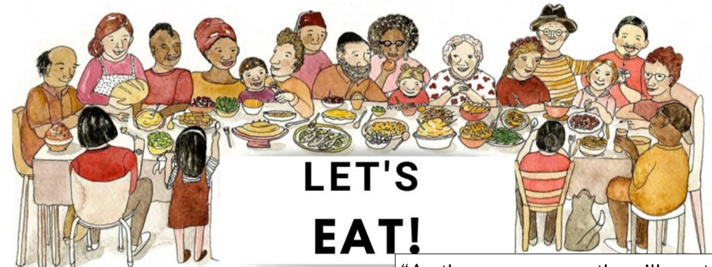
Cover artwork (adapted) by Marcella Kriebel © 2022 Marcella Kriebel www.marcellakriebel.com

Cross of Glory Office hours: M-W 10-2 www.crossofglory.us 763-533-8602