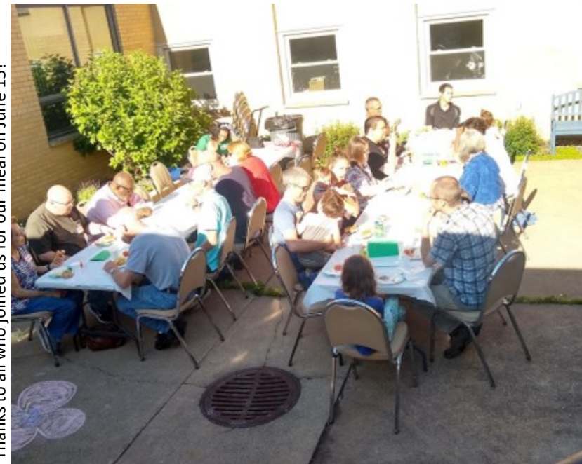
Thanks to all who joined us for our meal on June 15!